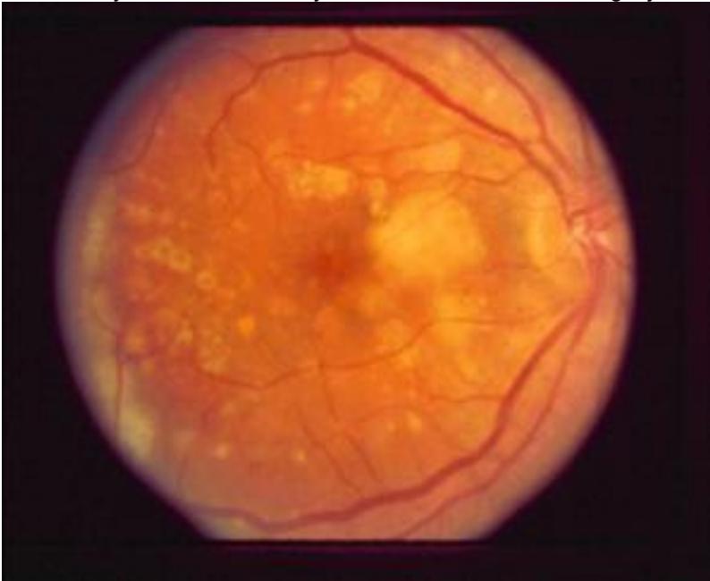
Figure 1 Fundus photograph, right eye.

A 29 year-old female presented with a sudden bilateral onset of decreased vision occurring one day prior to presentation. Examination revealed mild rhinorrhea and pharyngeal hyperemia, visual acuities of 20/400 and counting fingers at 4 feet in the right and left eyes respectively. External and slit lamp examinations were unremarkable, and intraocular pressures were within normal limits. Fundus examination revealed numerous discrete yellow lesions involving the macula as well as the peripheral retina (Figs. 1,2). A fluorescein angiogram was obtained, and showed bilateral multifocal hypofluorescent lesions with hyperfluorescence during the late venous stages of the study, evident in both eyes several minutes following injection (Figs. 3, 4).