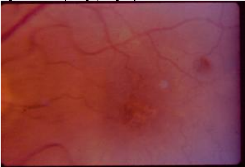
Figure 2 Fundus photograph, left eye. A close-up view of the macula.